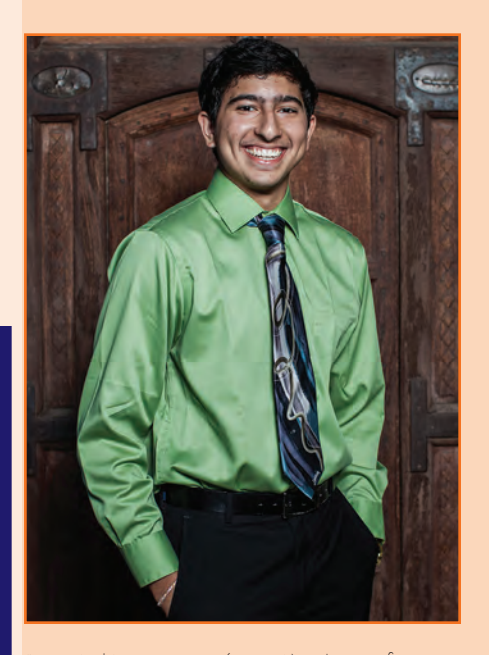
"I wanted to express a sincere thank you for establishing the Leadership Award as well as the IMPACT Program as a whole. I am so glad that you have granted me with such an amazing opportunity."