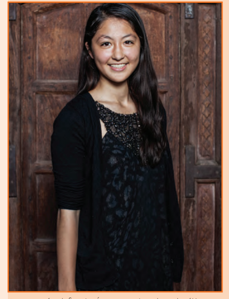
"I am excited for the journey ahead and will continue my service throughout college, hopefully expanding my work to a global level. Thank you again for widening a path of valuable opportunities. I admire your generosity and hope to one day support students in the way you have supported me."